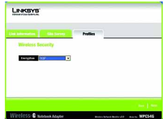
Figure 6-18: Encryption Type

Click Next to continue or Back to return to the previous screen.